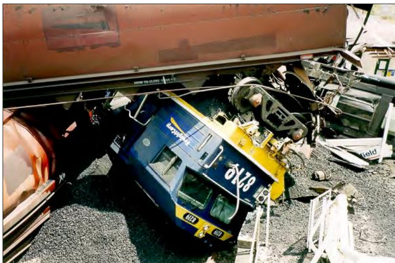
Original Photo taken by New South Wales Department of Transport, 1997